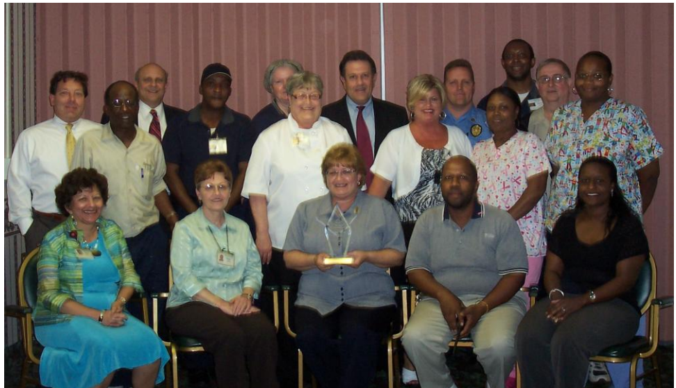
St. John Towers Employees With SAHMA Award